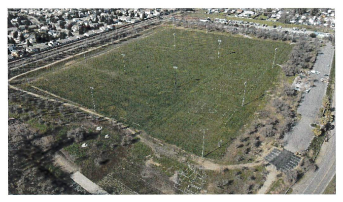
Park Shade Structure Rehabilitation – Mattie Harrell Park