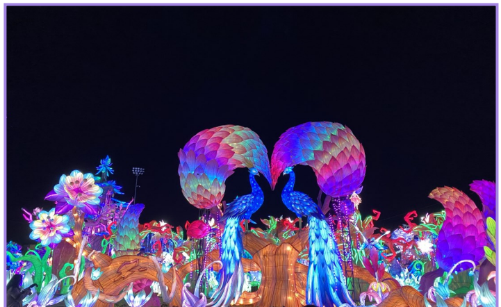
Stockton Lantern Festival