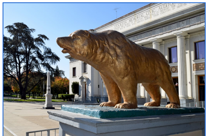
Stockton Memorial Civic Auditorium

It is within this philosophy that the attached State and Federal Legislative Priorities and Positions are adopted.