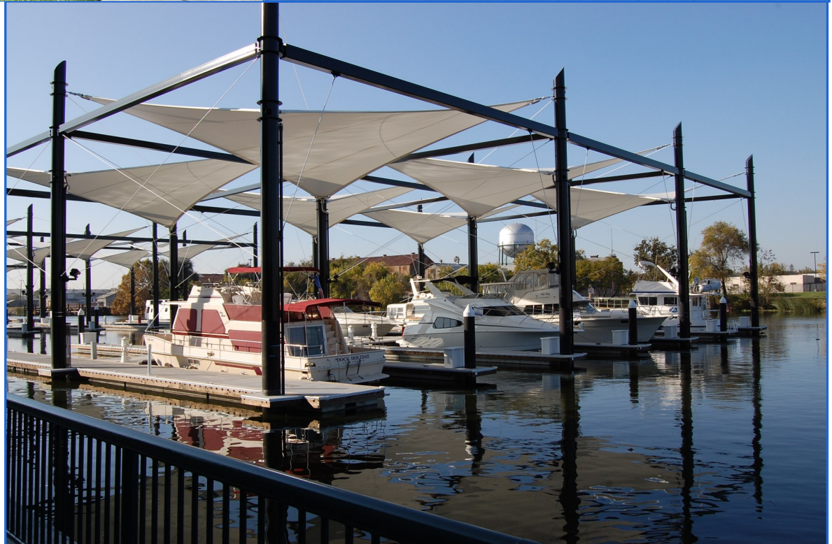
Stockton Downtown Marina