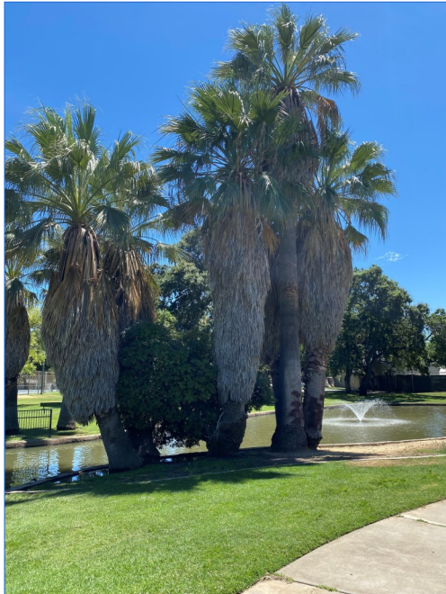
Victory Park and Haggin Museum

Oppose changes to the Bay Delta Conservation Plan that would alter Central Valley Project, State Water Project or Combined Operations of the Delta Cross Channel in a way that would negatively affect water quality at the Delta Water Supply Project (DWSP) intake or at the discharge location for the RWCF.