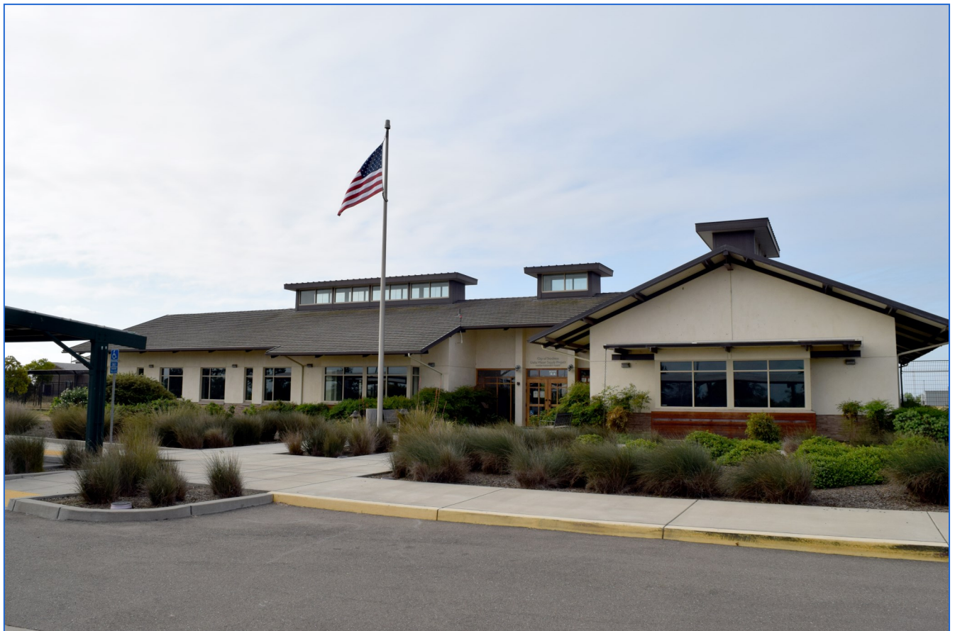
Delta Water Treatment Plant

Support legislation or other administrative actions that protects the interests of the City regarding groundwater management in the basin, the consolidation of water districts or other agencies and reinforces the powers and improves collaboration between groundwater sustainability agencies.