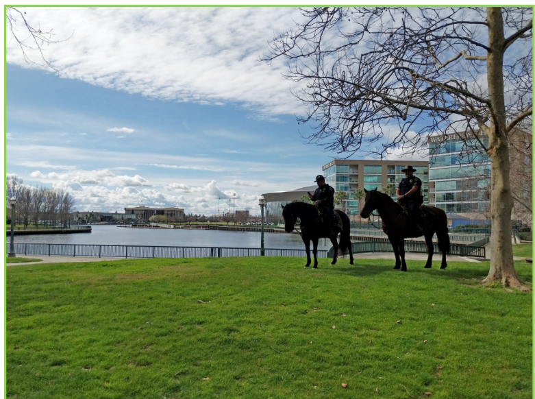
Equestrian Unit, Stockton Police

Action: This project will provide updated lighting, wall finishes, and expansion into the previous technology area so that officers can begin their shifts in a modern Roll Call Room consistent with other agencies that are recruiting our valued staff. The upgrades will provide a morale boost and investment in employee retention.