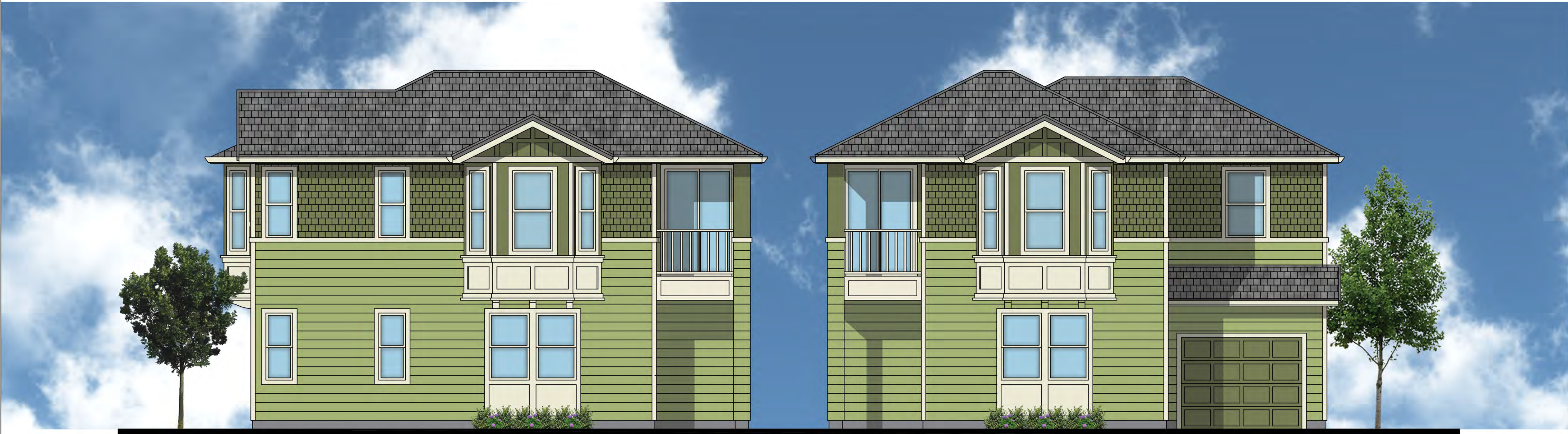
HUNTER STREET SIDE ELEVATION