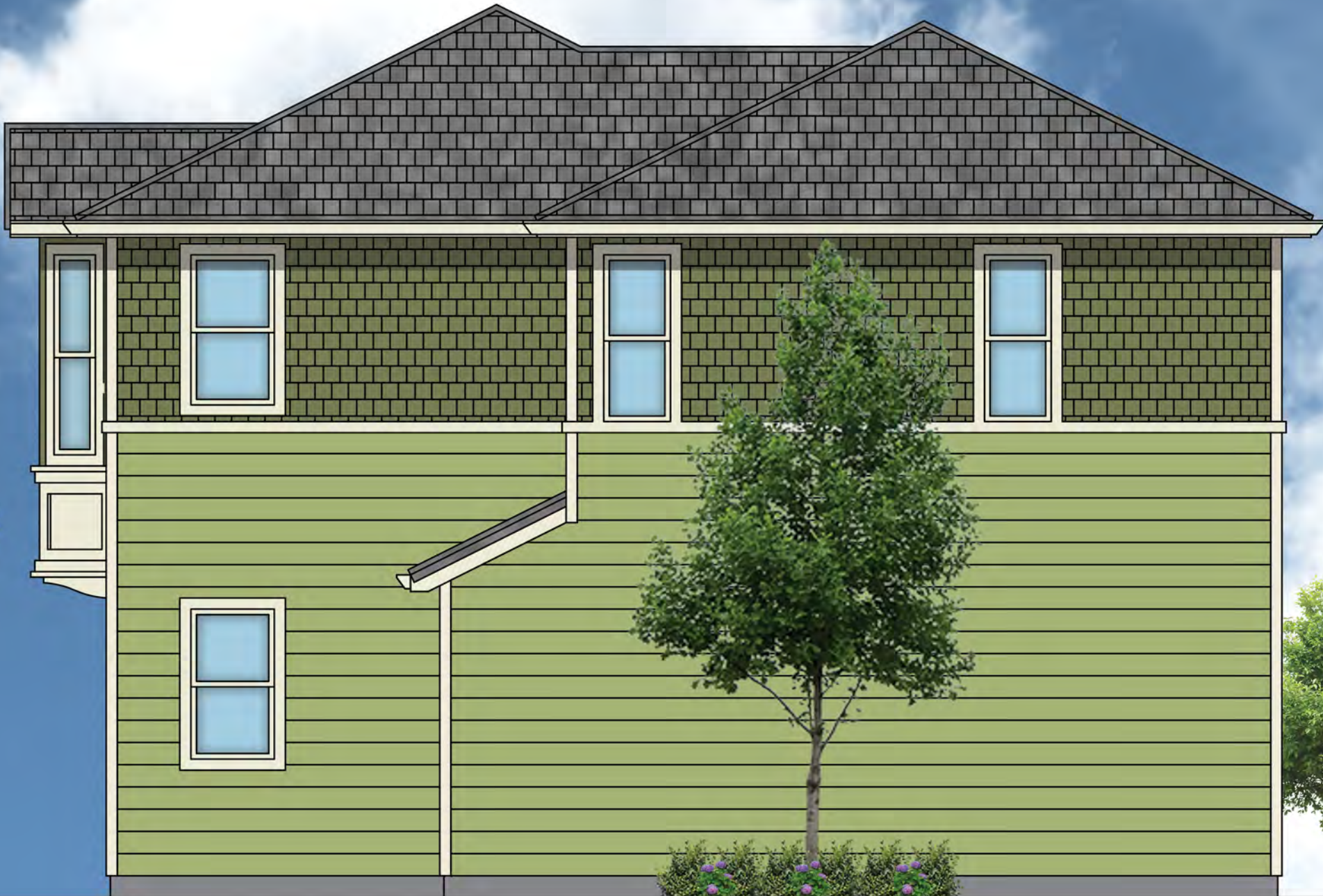
SOUTH (REAR) ELEVATION