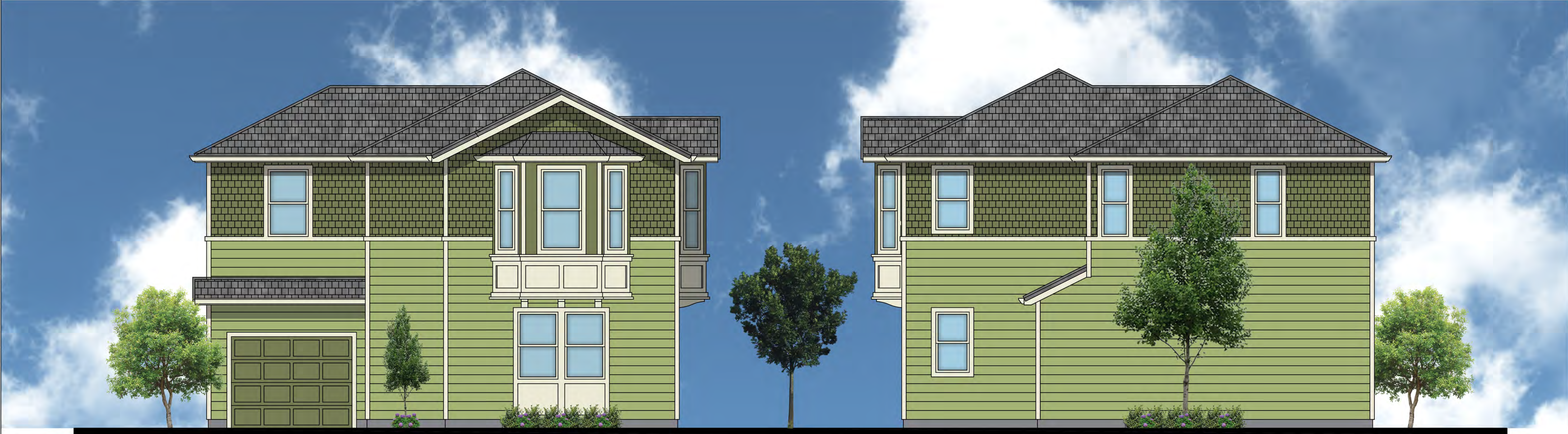
FLORA (FRONT) STREET ELEVATION