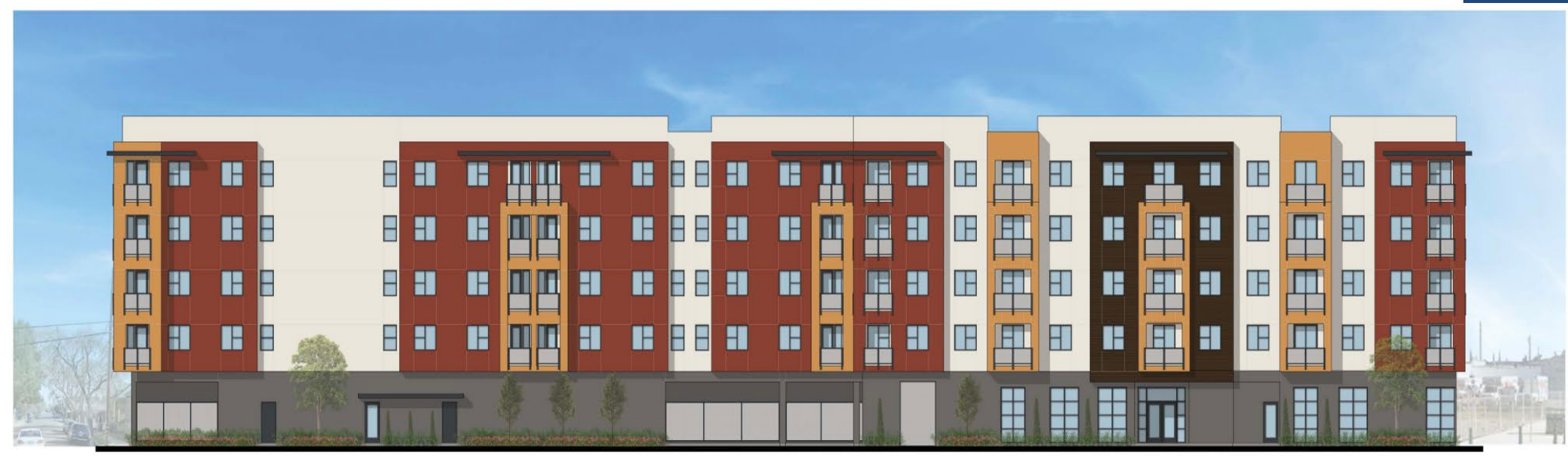
North American Street Elevation