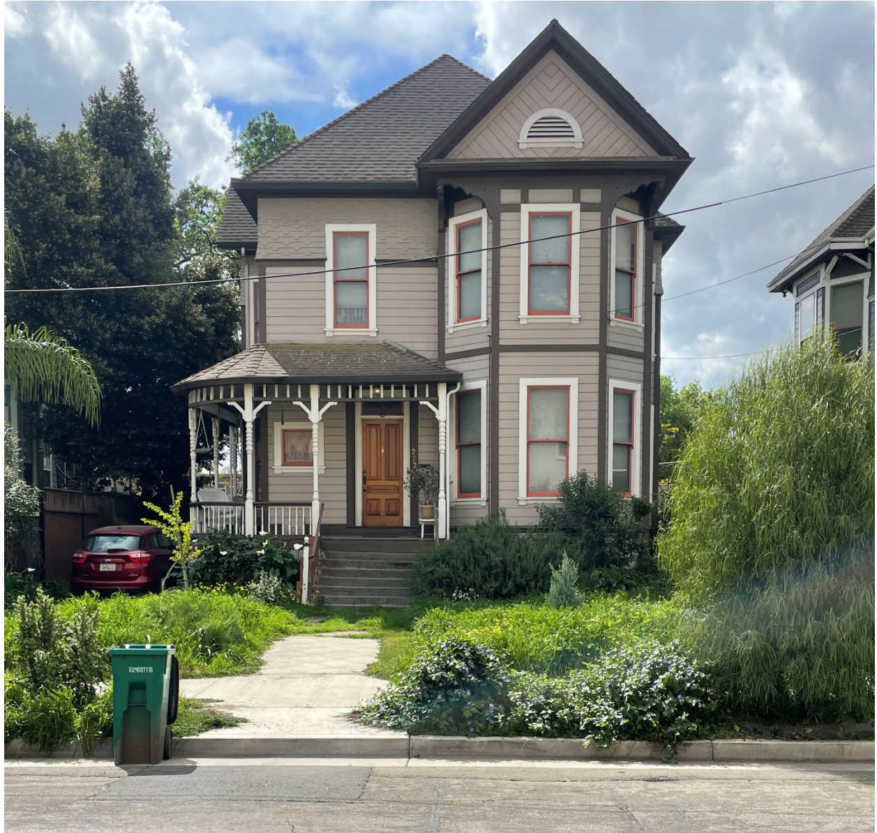
222 East Flora Street (2025)