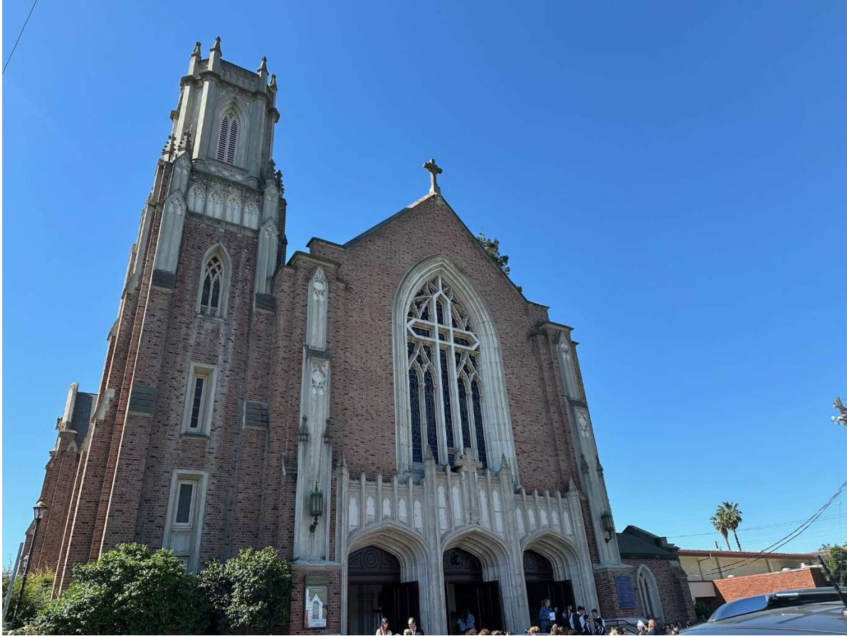
Current Site Photo (May 14, 2024)