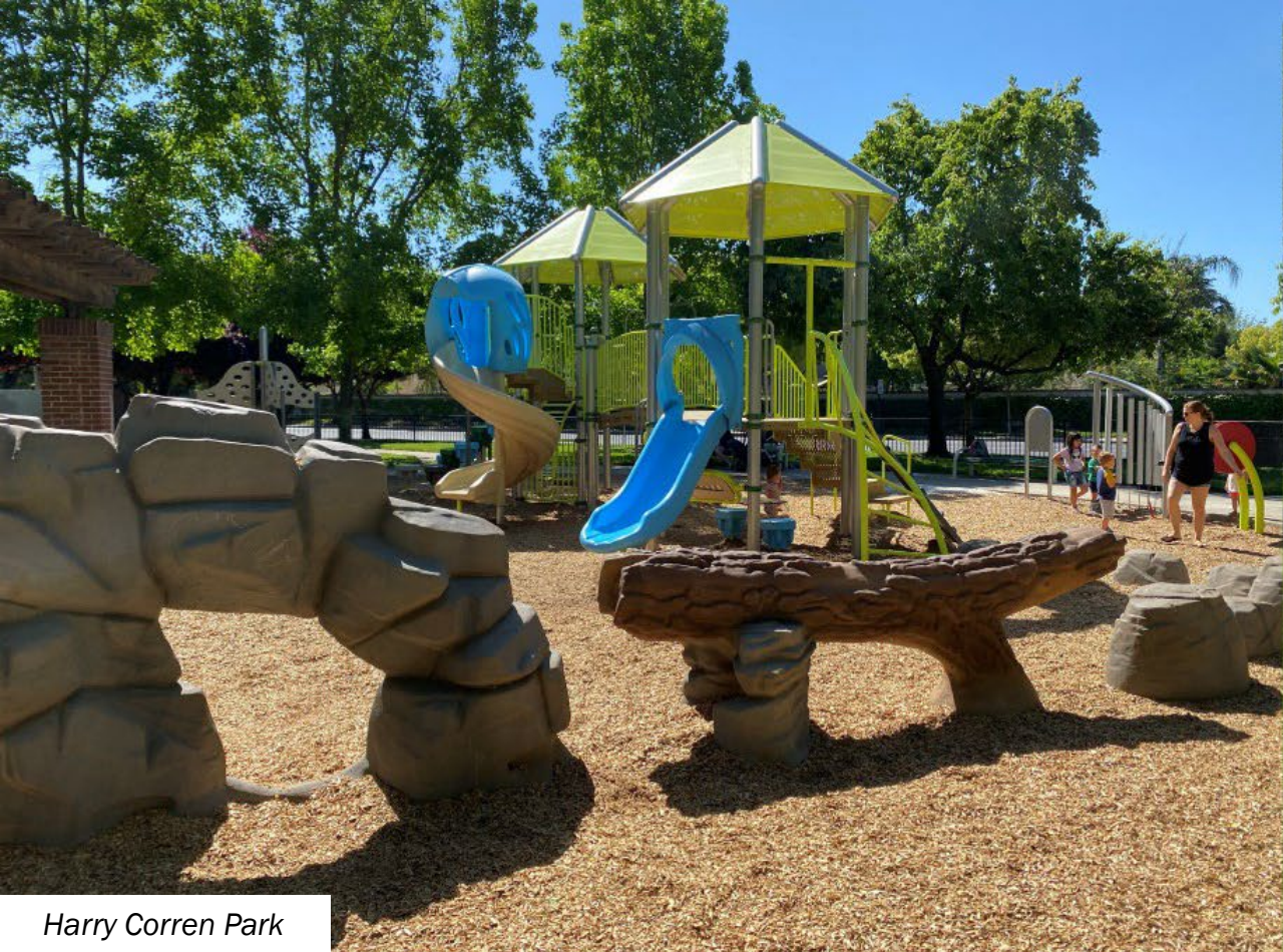
Harry Corren Park