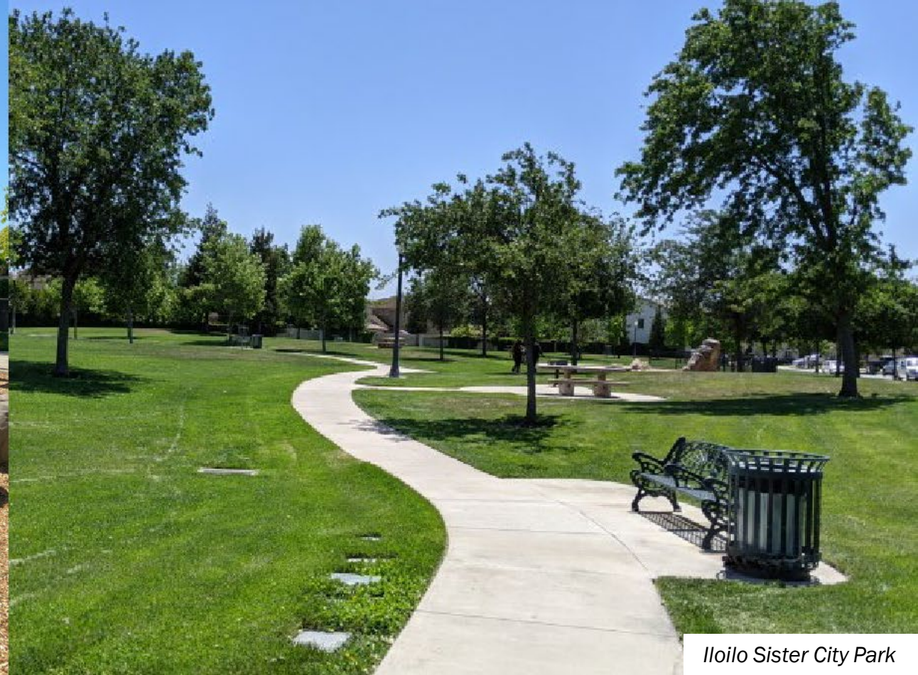
Iloilo Sister City Park