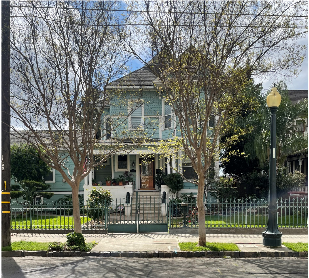
228 and 234 East Flora Street (2025)