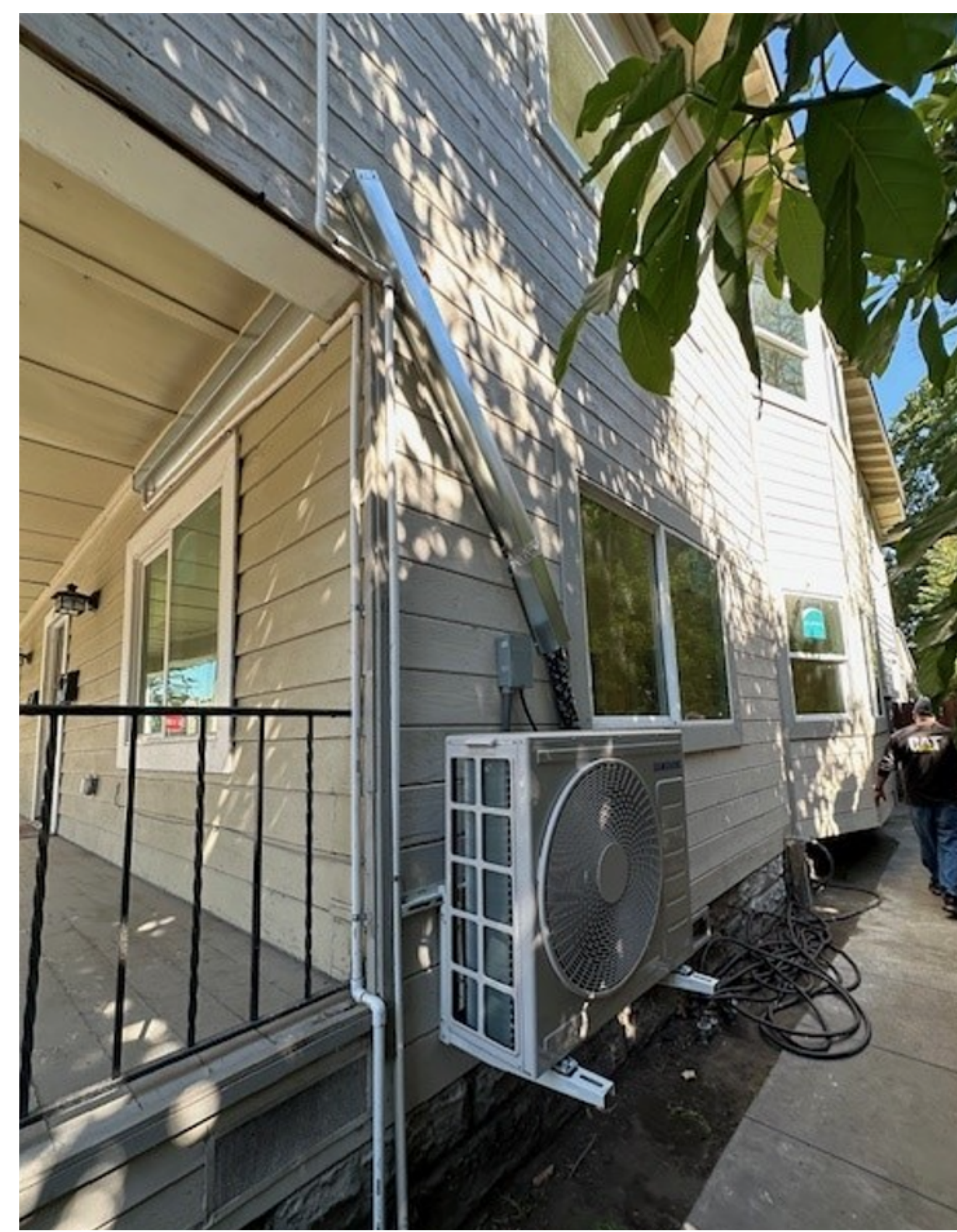
Current Condition photo of the east elevation showing areas where application of new siding. Image also shows new window and trim types.