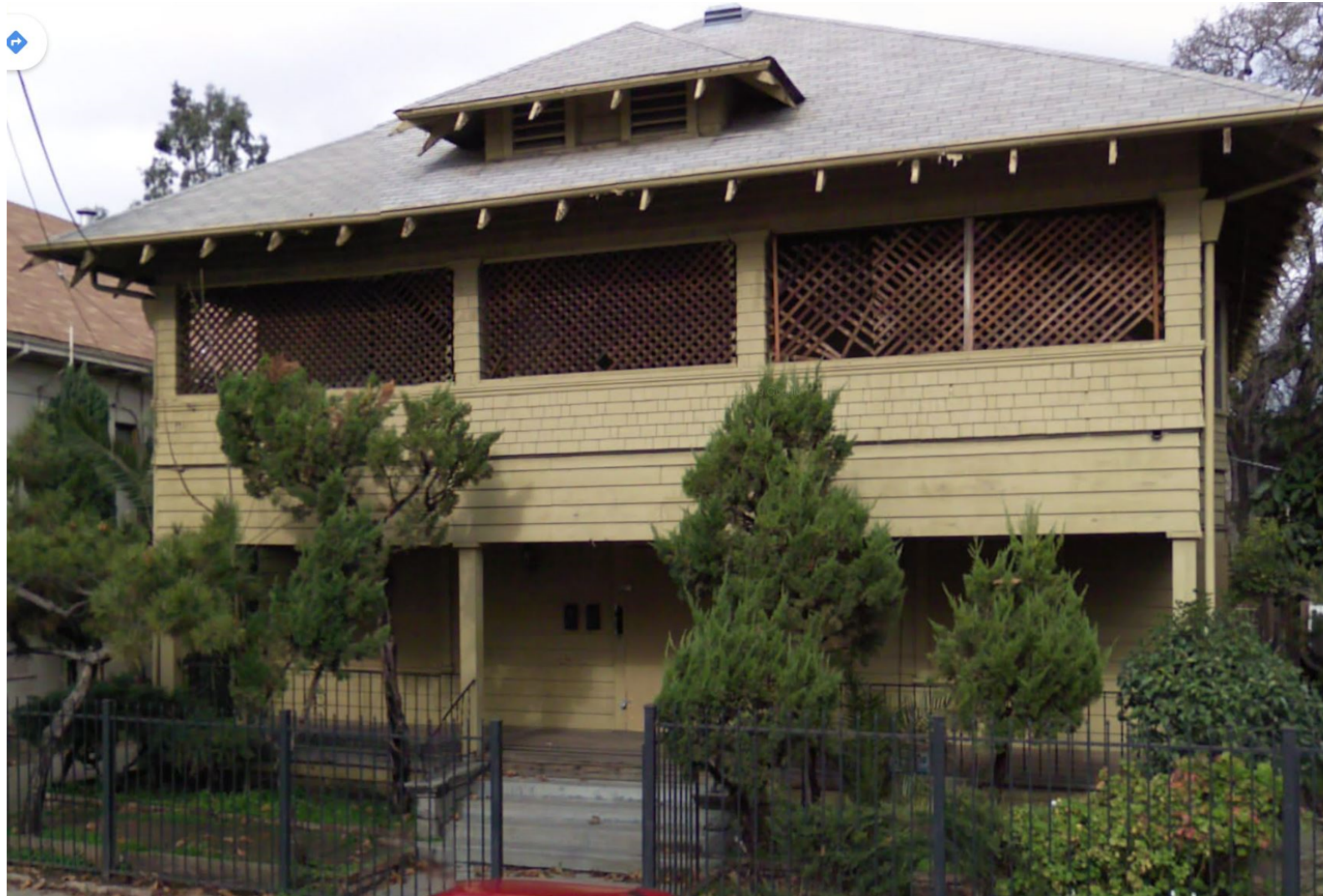
Front (south) elevation.

Images show the building showing the shake and stacked lap siding on the south (front) and west elevations. Older west elevation view is unavailable due to vegetation.