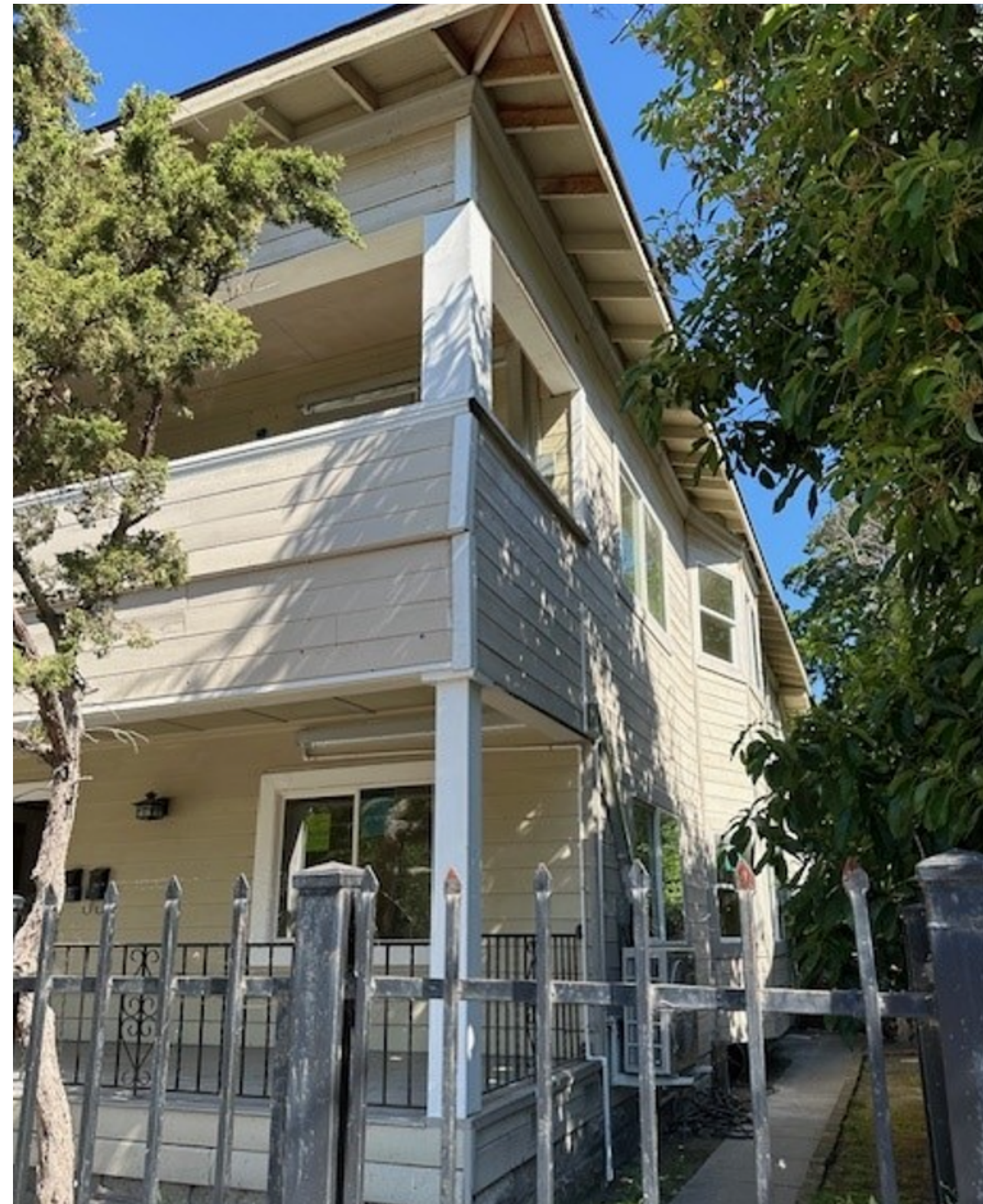
Current Condition photo of the southeast elevation showing new siding and window and trim replacements.