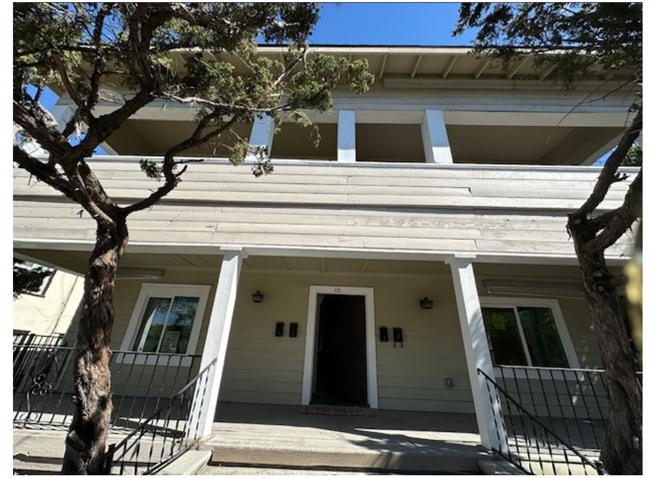
Closer view of south elevation existing conditions.