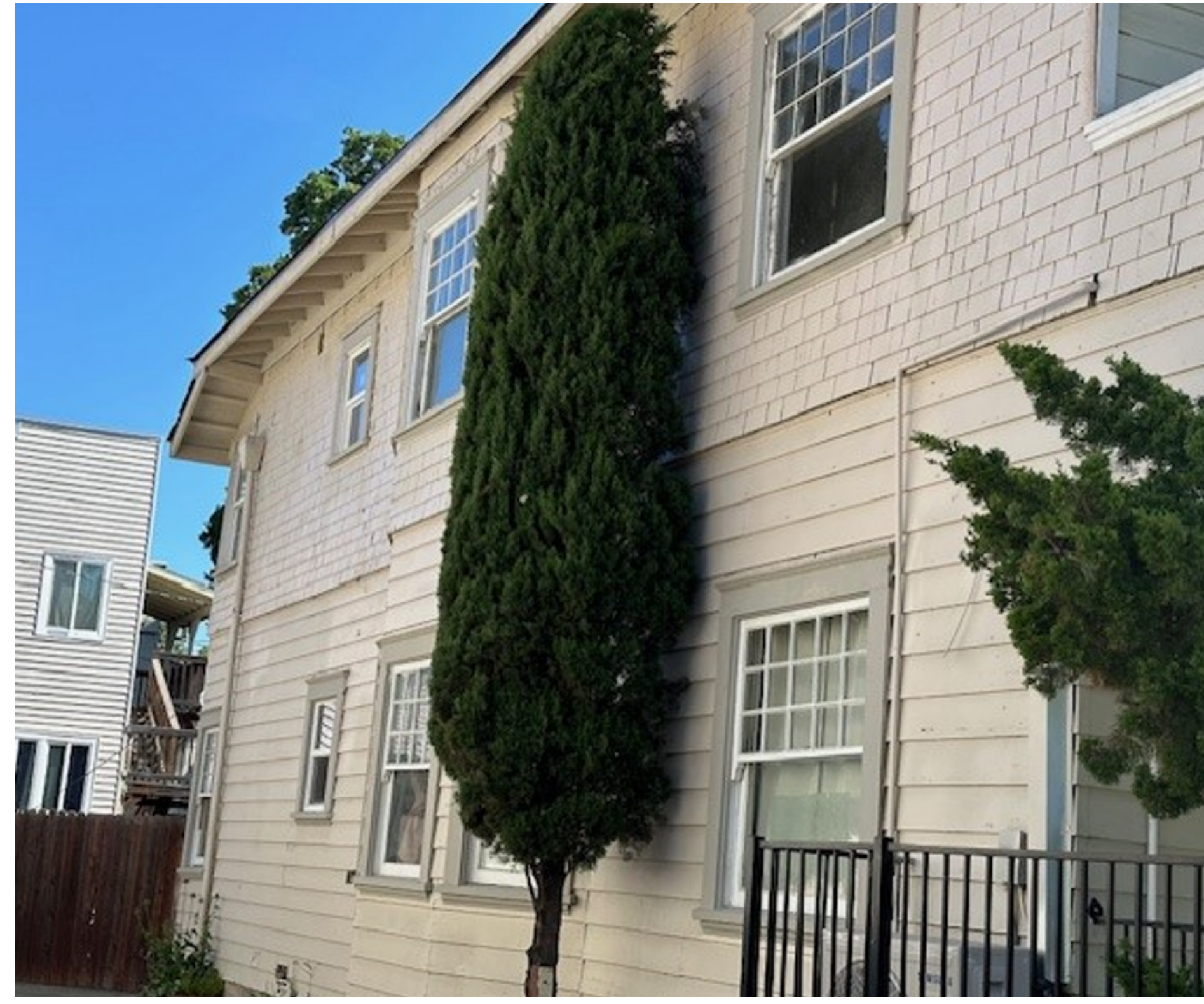
Closer view of west elevation existing conditions.