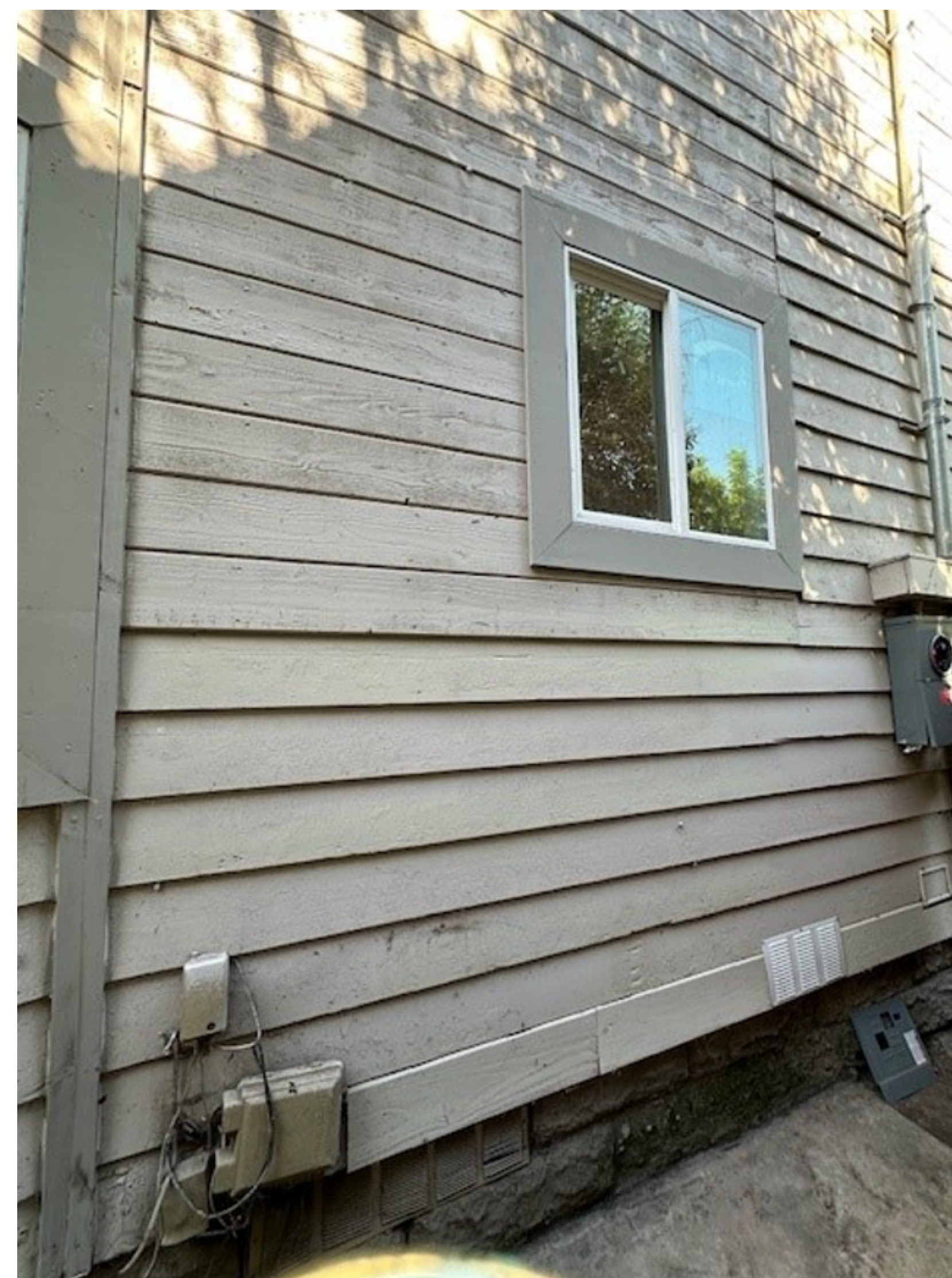
Current Condition photo of the east elevation showing areas where application of new siding and existing siding occur. Image also shows new window and trim types