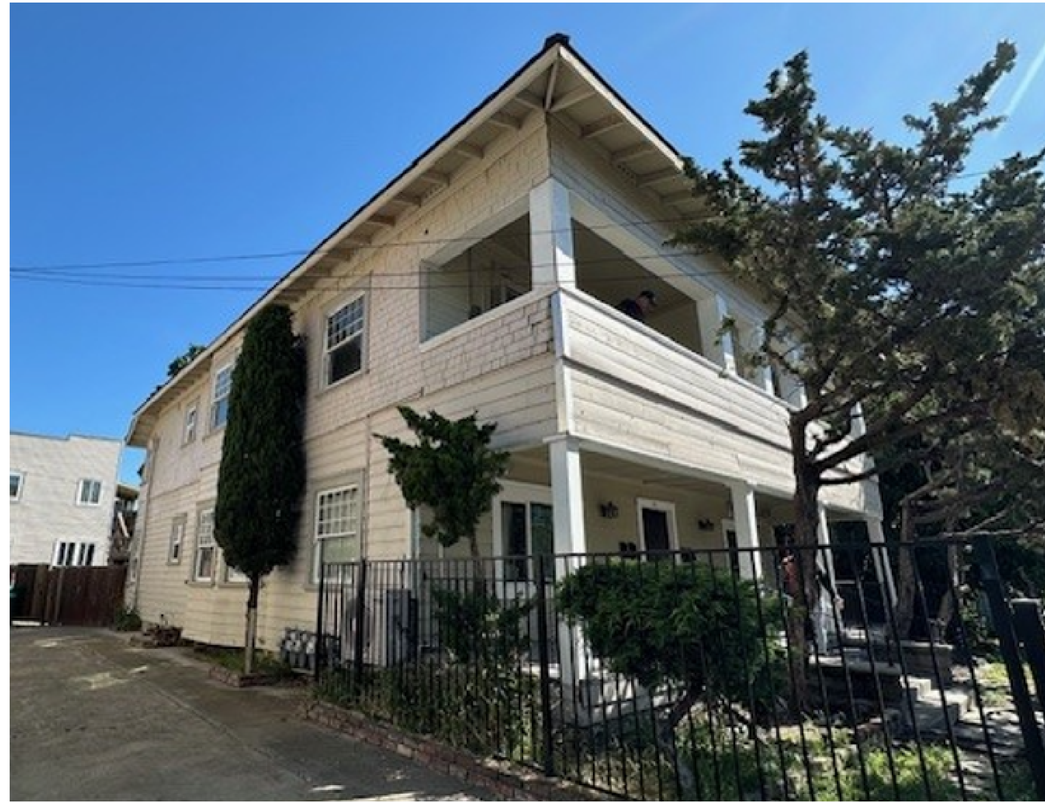
Current Condition photo of the southwest corner of the building showing the original shake siding and windows and trims that remains on the west elevation, and the replacement siding and windows on the front (south) elevation.