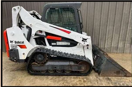
BOBCAT SKID STEER