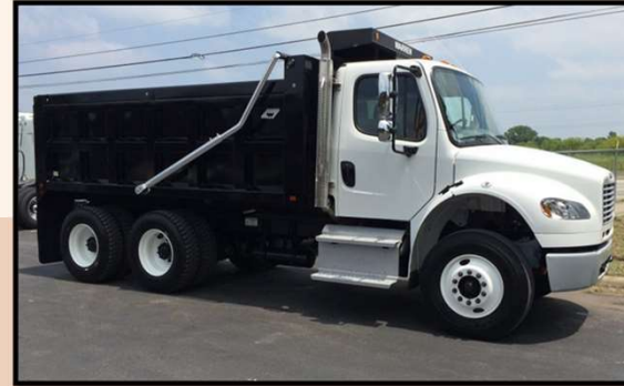
10-WHEEL DUMP TRUCK