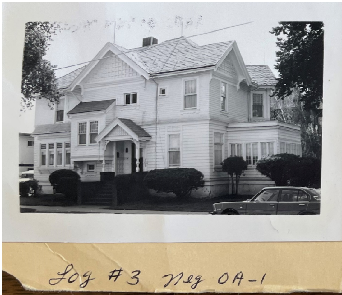
745 North San Joaquin Street(1977)