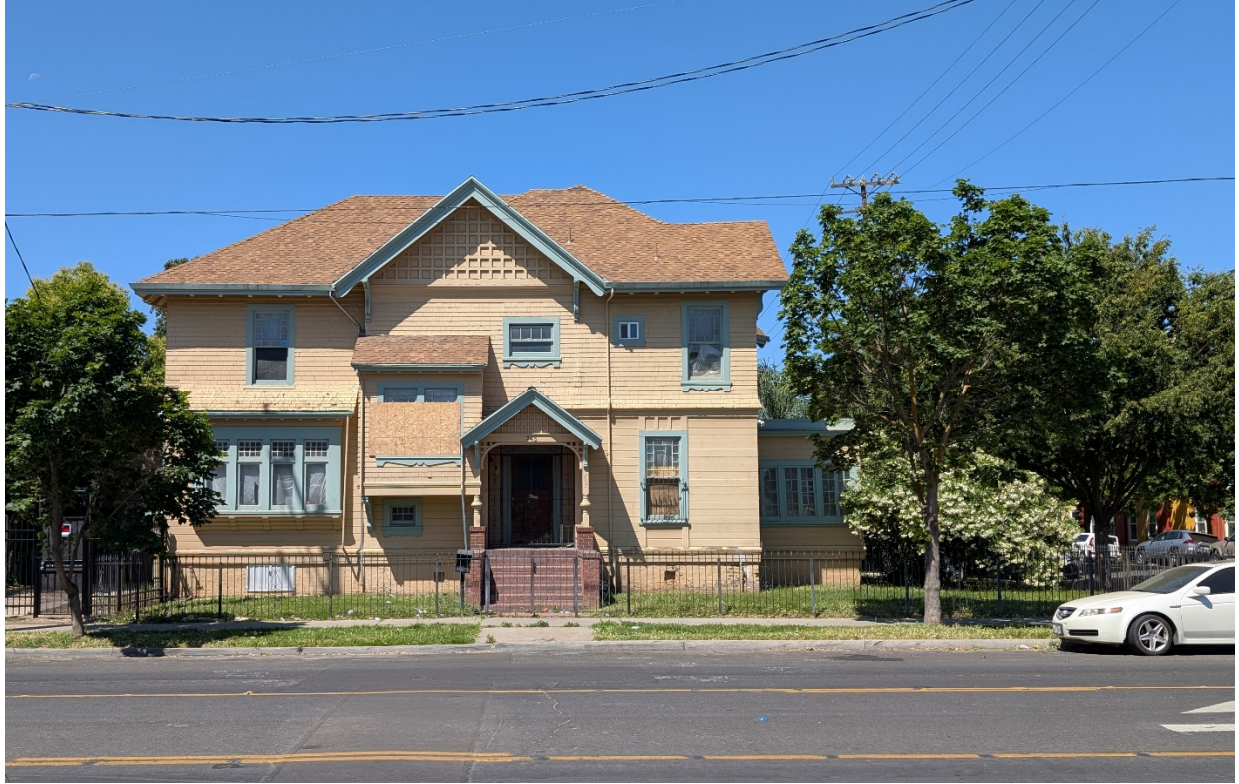
745 North San Joaquin Street(2025)