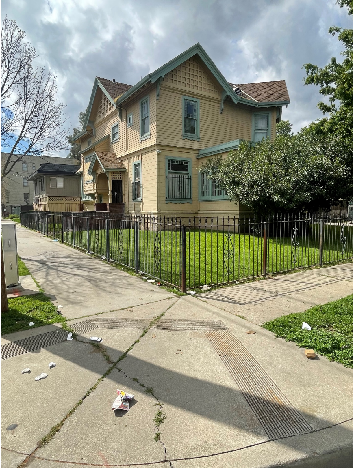
745 North San Joaquin Street(2025)