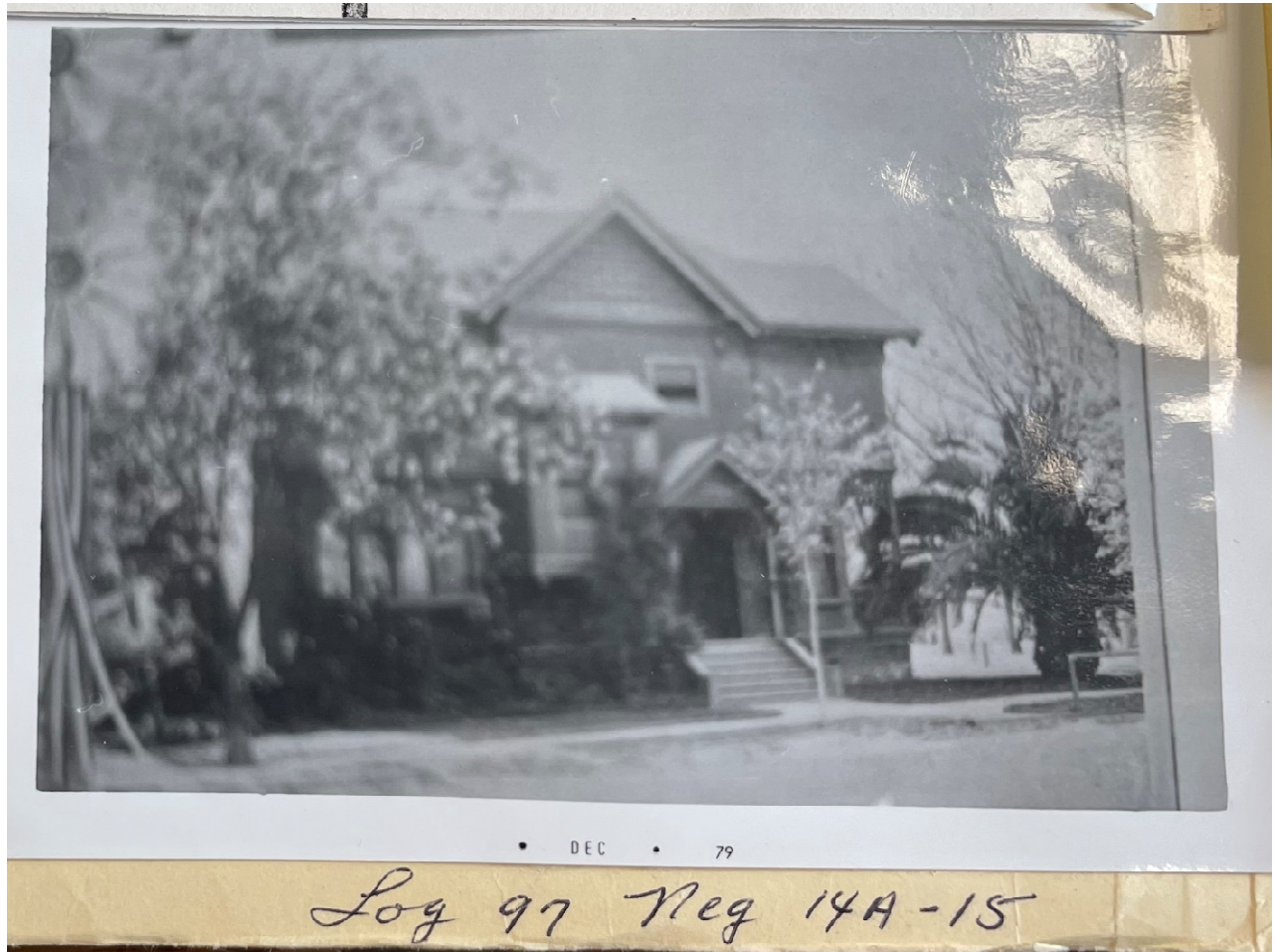
745 North San Joaquin Street(1977)