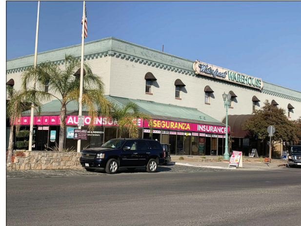
EXISTING VIEW FROM WEBER AVE.