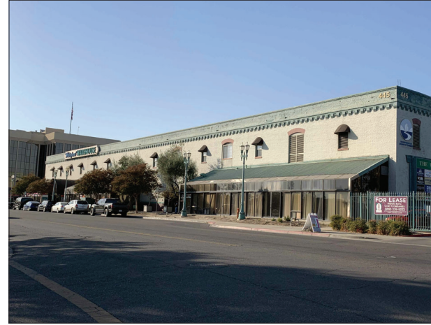
EXISTING VIEW FROM WEBER AVE.