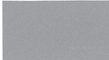
METAL ROOFING & ACCENT BAND