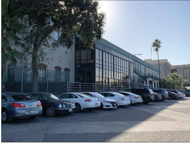
EXISTING VIEW FROM McLEOD LAKE