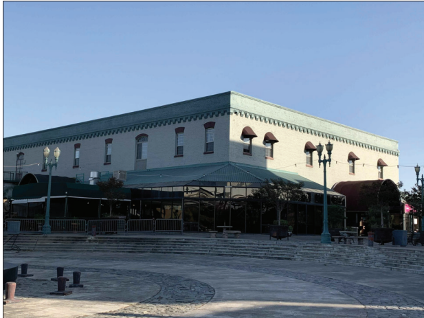
EXISTING VIEW FROM McLEOD LAKE