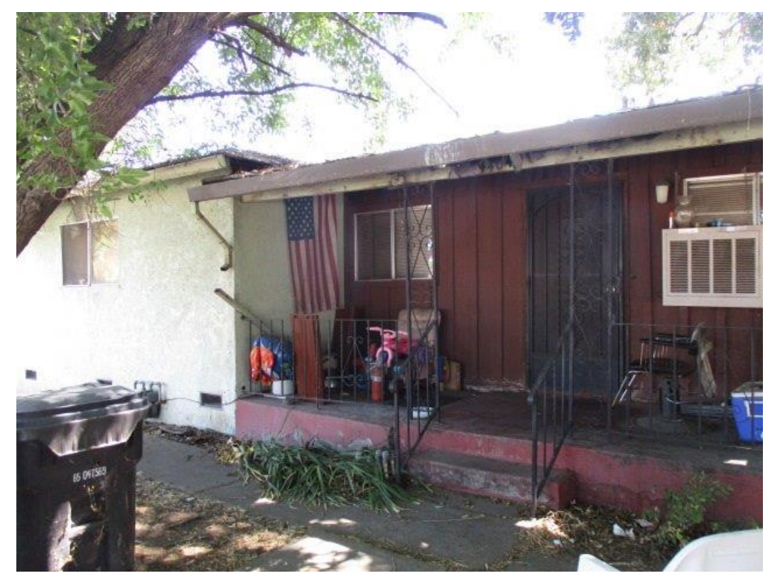
2440 S. Monroe Street