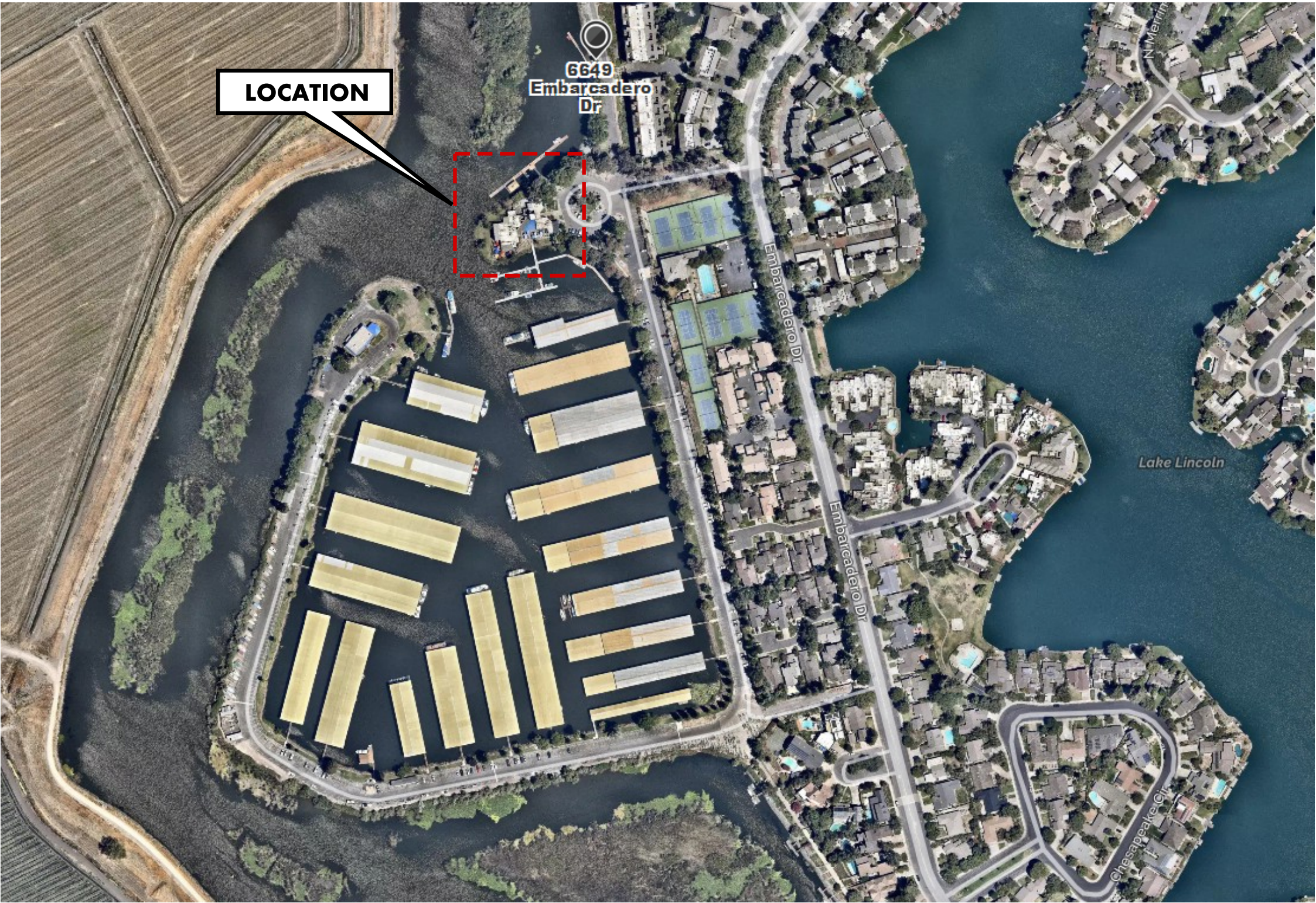
aerial site plan