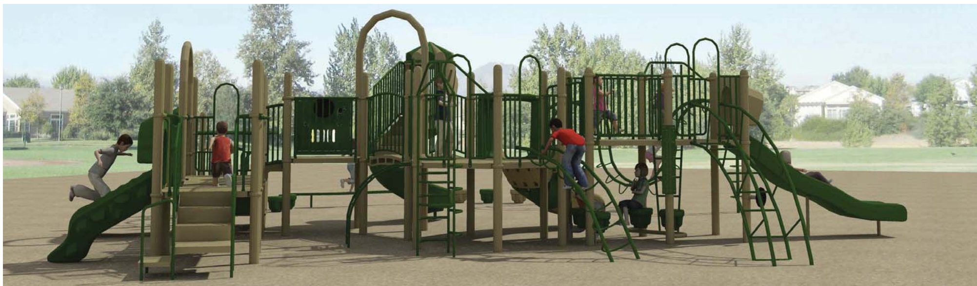
Holmes Park Stockton, CA. 5/17/16