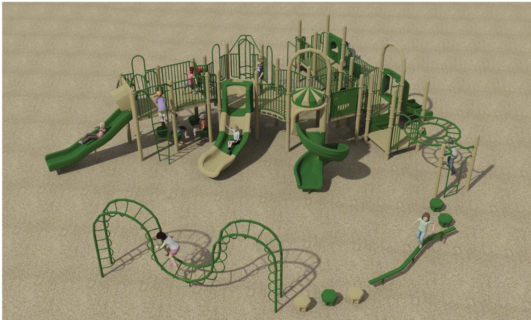
Colors Used In Rendering