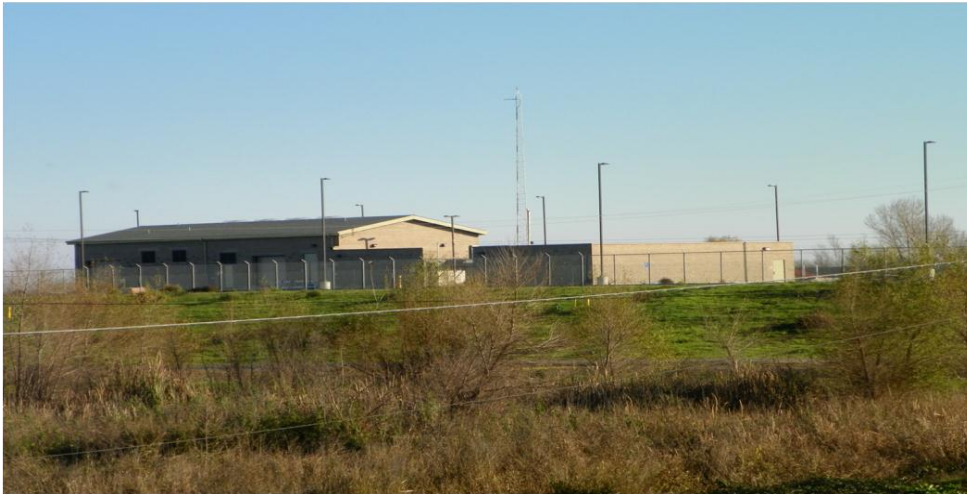
The Intake Pump Station (IPS) on the San Joaquin River west of Interstate 5.

Appendix B: Delta Water Supply Project Intake Pump Station; elevation changes on non-pile supported areas of the levee.