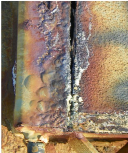
Photos above and at the right are close-ups of corrosion on the two-year-old utility vault doors in Van Buskirk Park.