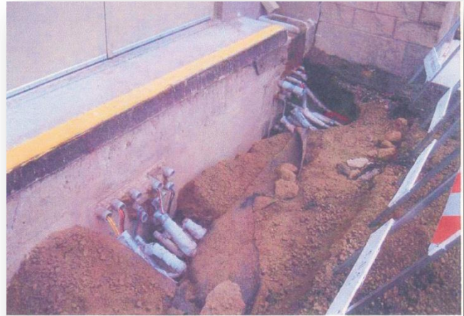
North Side of Pump House

A Cal/OSHA complaint was filed regarding conditions at the IPS and MUD acknowledged in its January 2, 2015 response that the area experienced subsidence. As a result, electrical wiring was exposed at the north side of the pump house and the generator yard. Repairs by an outside contractor were expected to proceed by the end of March 2015 at a cost of nearly $40,000. An assessment of the potential settlement in the area of the IPS by its design engineer HDR, Inc. was to be completed by April 30, 2015.