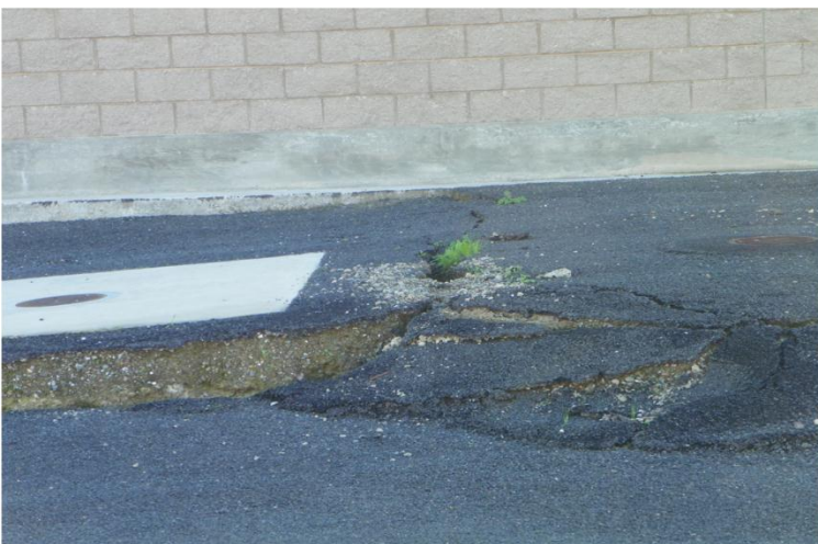
Buckled asphalt at the IPS because of soil settling.