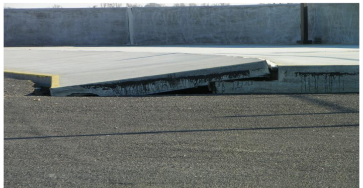
A concrete slab has shifted due to soil settling at the IPS.