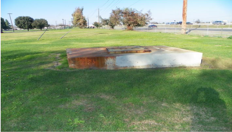
A utility vault at Van Buskirk Park with a cyclone fence in the background. Both show signs of corrosion.