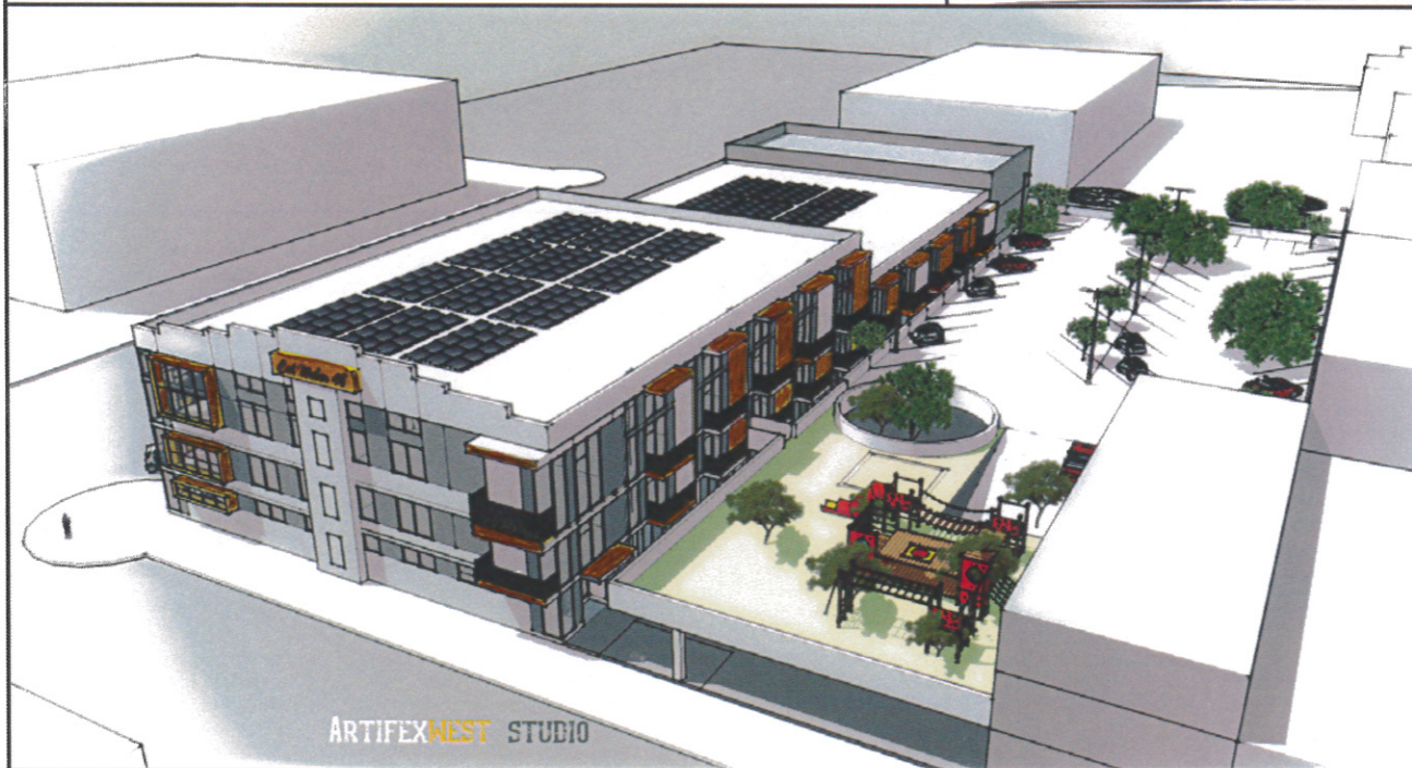
Birds eye view of podium area with parking below as well as PV solar array located on the roof