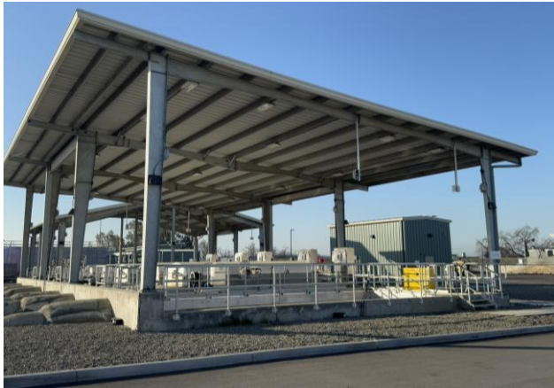
Disk Filters January 2025