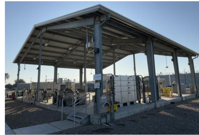
UV Disinfection January 2025