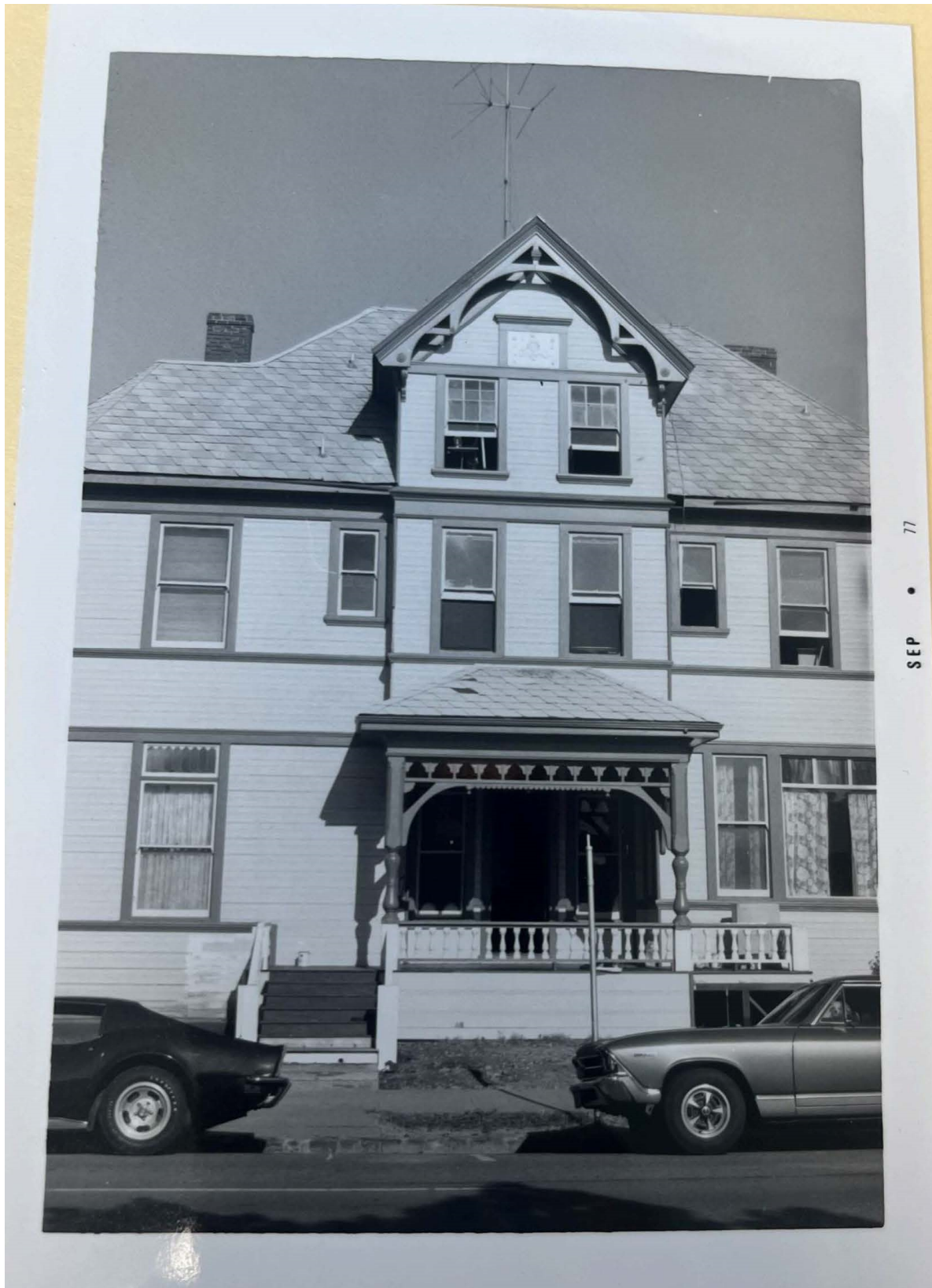
748 North Hunter Street(1977)