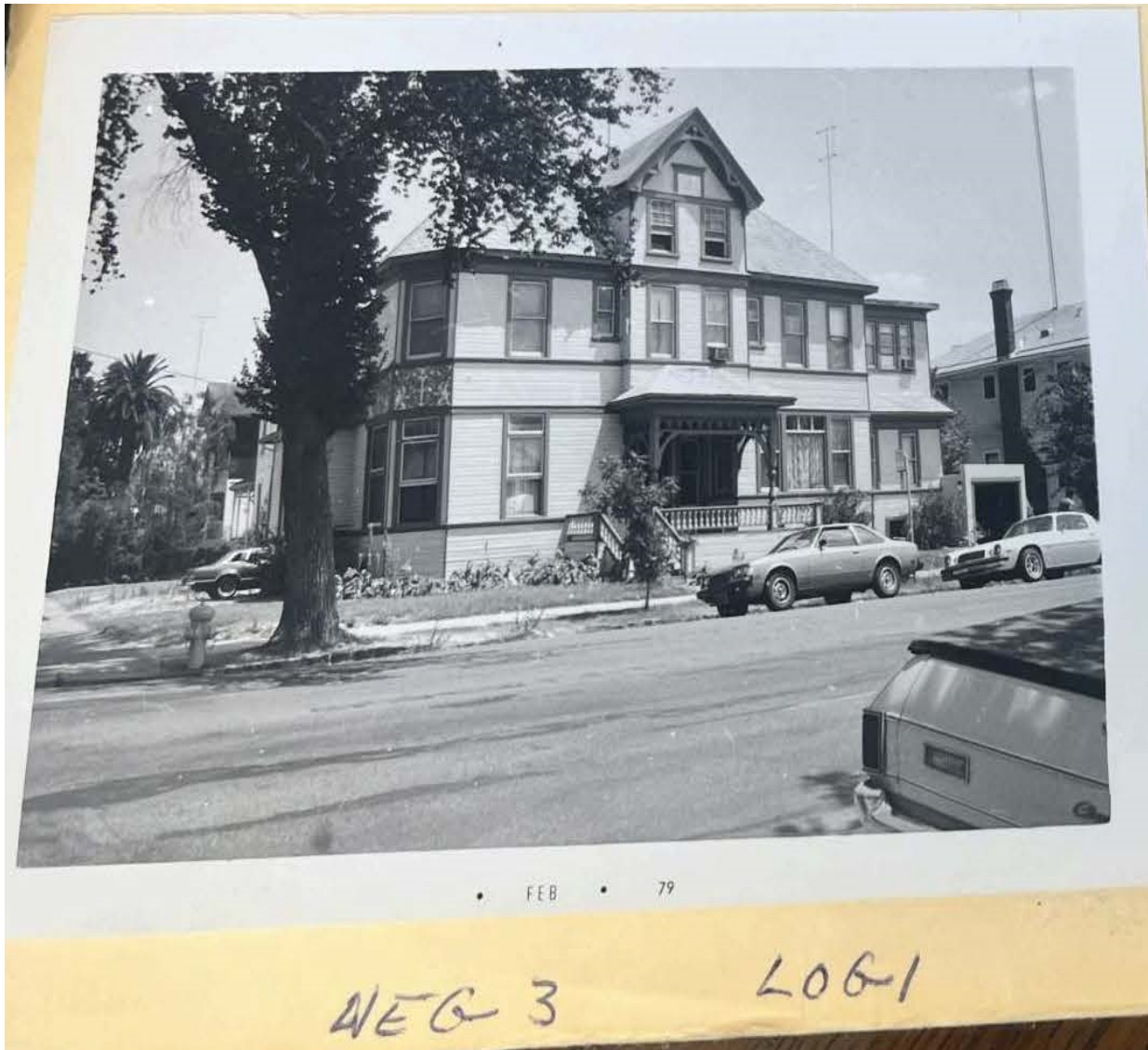
748 North Hunter Street(1977)