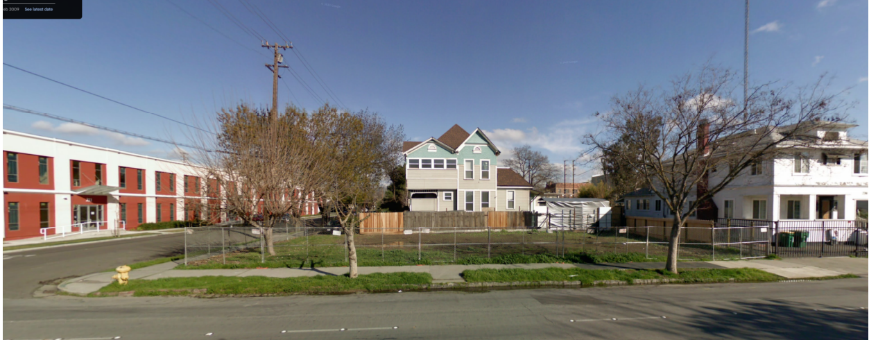
748 North Hunter Street (Google Streetview, February 2009)