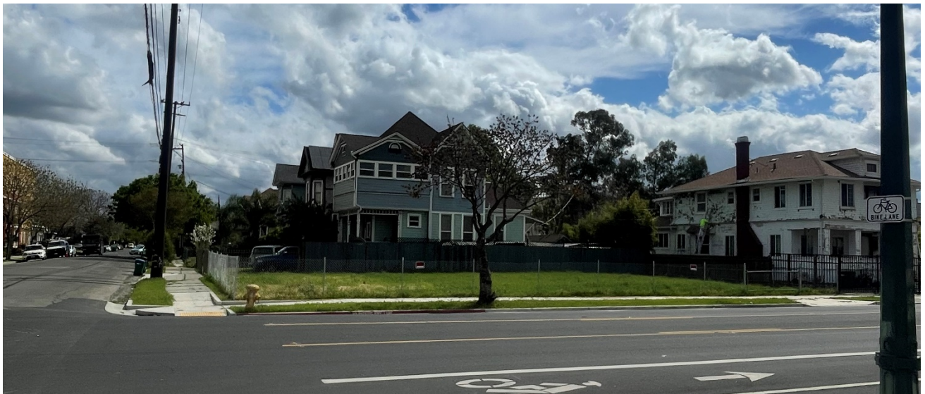
748 North Hunter Street (2025)