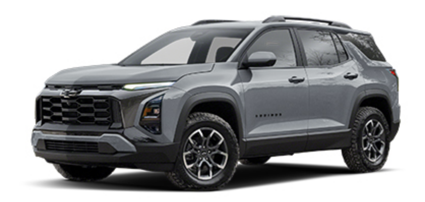
[Fleet] 2025 Chevrolet Equinox (1PT26) 4dr AWD LT

This document contains information considered Confidential between GM and its Clients uniquely. The information provided is not intended for public disclosure. Prices, specifications, and availability are subject to change without notice, and do not include certain fees, taxes and charges that may be required by law or vary by manufacturer or region. Performance figures are guidelines only, and actual performance may vary. Photos may not represent actual vehicles or exact configurations. Content based on report preparer's input is subject to the accuracy of the input provided.