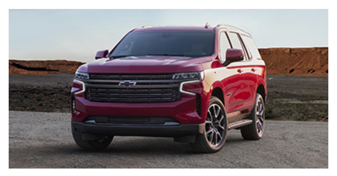
Note:Photo may not represent exact vehicle or selected equipment.

City of Stockton D4587 SSV ( ✓ Complete )