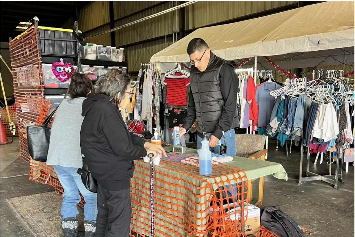
Clients receiving items from Clothing Closet