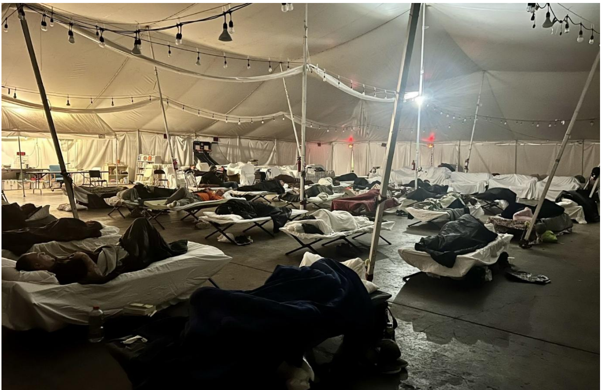
Safe and secure rest