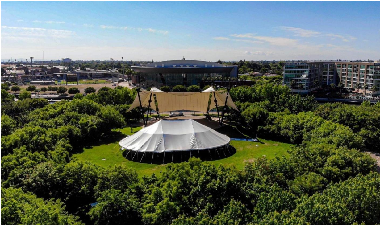
Tent by Inner City Action at Weber Point, Stockton 2019