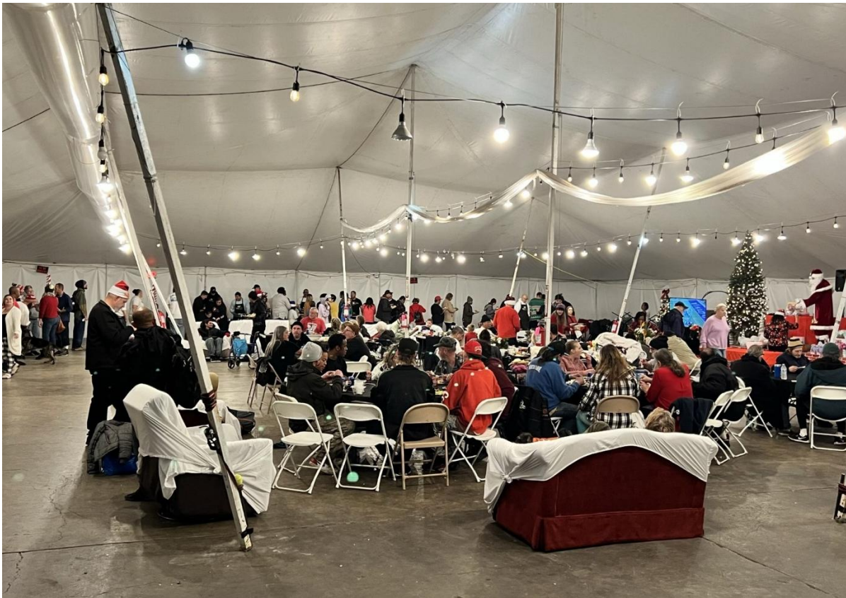
Holiday events with the clients