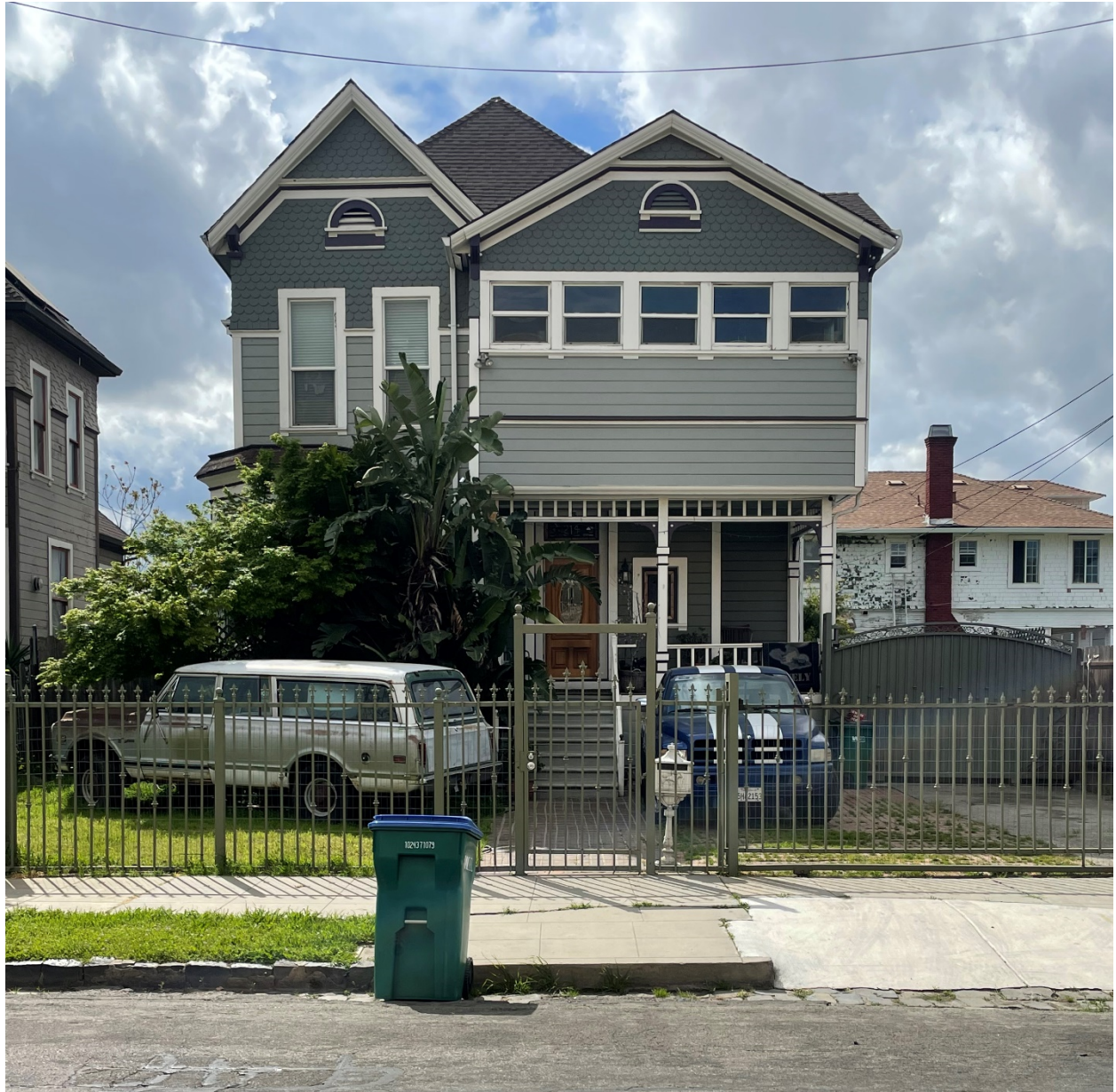
214 East Flora Street (2025)