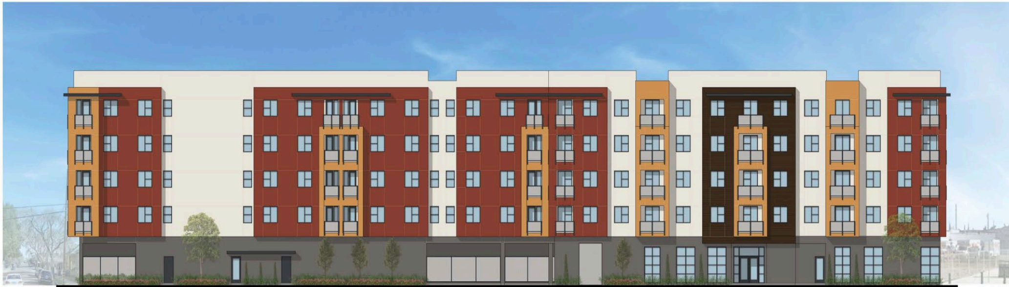
North American Street Elevation